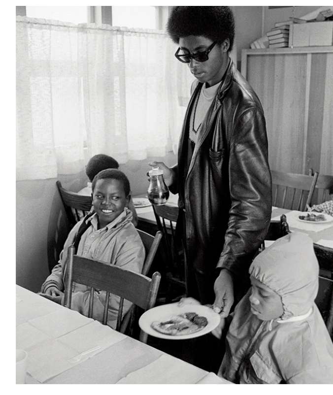
The Black Panther Free Breakfast Program, Oakland

The School Breakfast Program (SBP), like the NSLP, is administered by the USDA FNS. The SBP began as a two-year pilot program in 1966. Beginning in 1969, all chapters of the Black Panther Party were mandated by Panther co-founder Huey P. Newton to institute a Free Breakfast for Children Program, which was one of the party's "survival programs." <sup>2</sup> The Black Panther Party's program served as "both the model for, and impetus behind [the SBP]."3 Party members consulted with nutritionists on healthful breakfast.4 During the height of the program, thousands of children were fed per day in at least 45 different initiatives across the country.5 However, the program was not well-received by all and was systemically dismantled. Under the leadership of J. Edgar Hoover, the Federal Bureau of Investigations (FBI) targeted food programs across the country in an organized effort to destroy the Black Panther Party.6 While these efforts by the federal government were tragic and disastrous for the Black Panther Party, the visibility of the breakfast program provoked government officials to prioritize feeding children